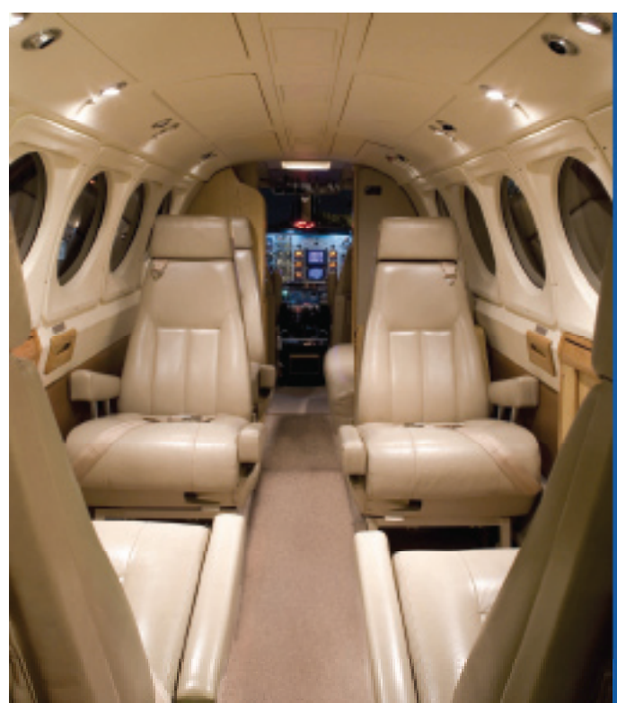
Club seating • Large cargo area • Multiple destinations in a day